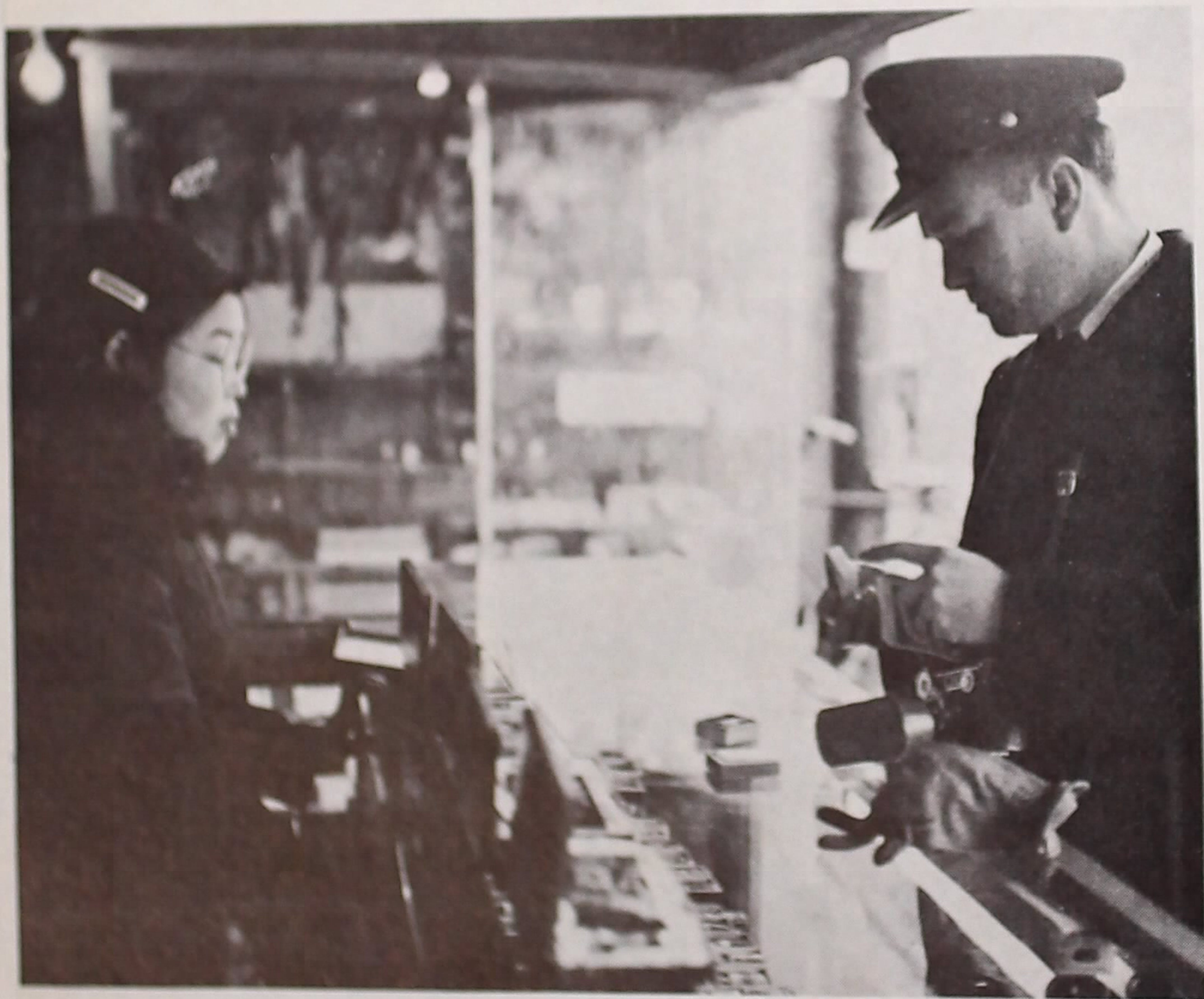
THE STREETS OF SASEBO . . .