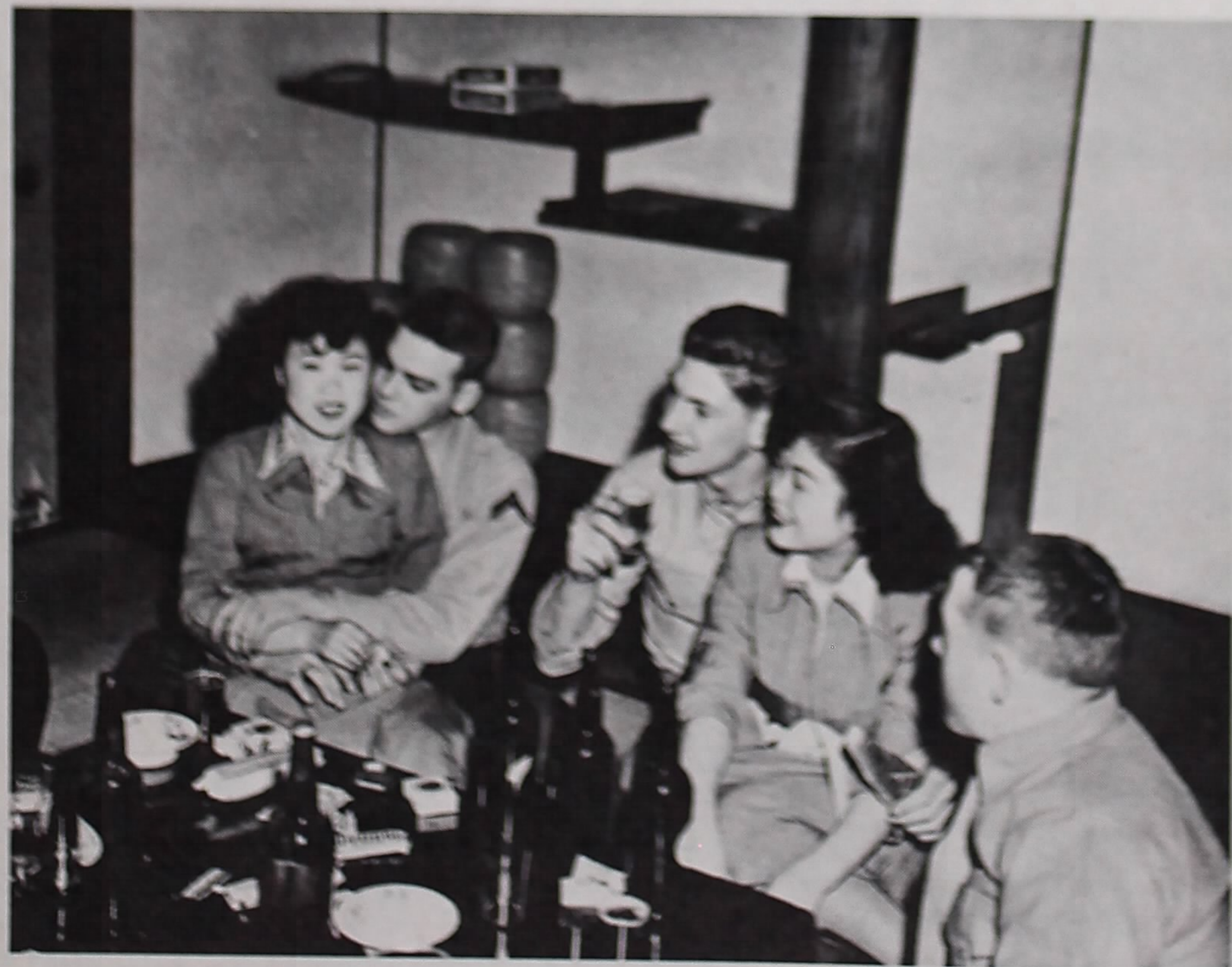
MANCHESTER MARINES LAND IN SASEBO . . .