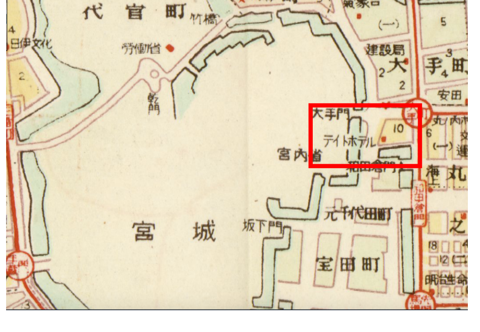
Picture 3: Once the Kempeitai HQ, it was the Hotel Teito as shown in the 1949 map.

http://www.bousai.go.jp/kyoiku/kyokun/ky oukunnokeishou/rep/1923kantoDAISHINSAI 2/pdf/10 chap2-2.pdf.