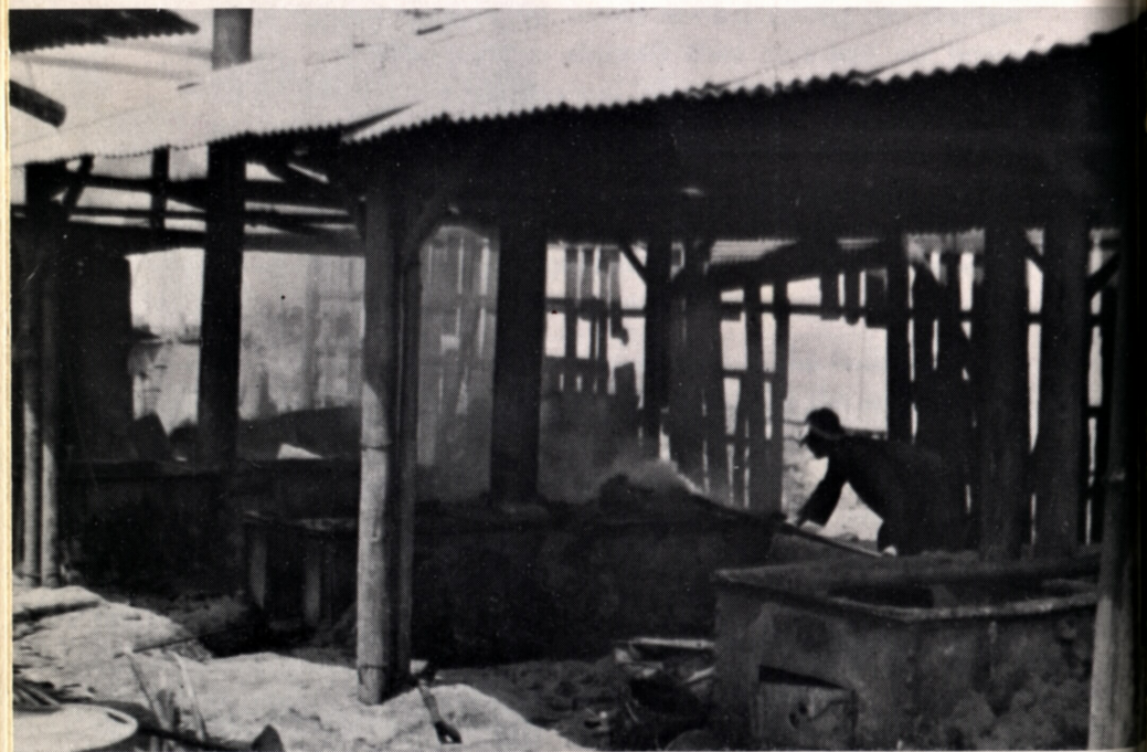
The asphalt pits at the Suzuki camp. The man is stirring hot pitch in one of the tubs.