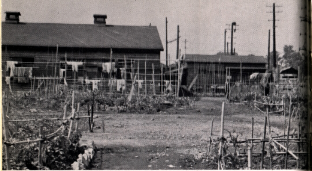
The Suzuki POW camp, where the author was held from November 1944 till July 1945. To the right is the area where POWs built air raid shelters—but were never allowed to use them. At the time of this photo, the camp was occupied by Japanese families.