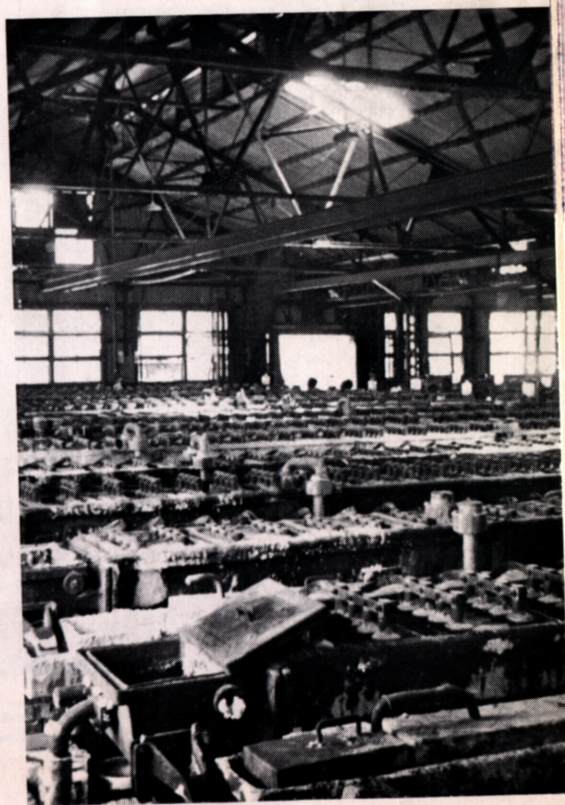
View inside the gas plant at the big Suzuki factory.