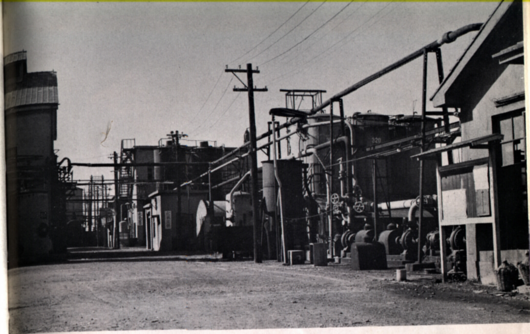
Looking down one of the many lanes at the Suzuki manufacturing plant at Kawasaki, from the gate entrance near the gas plant.