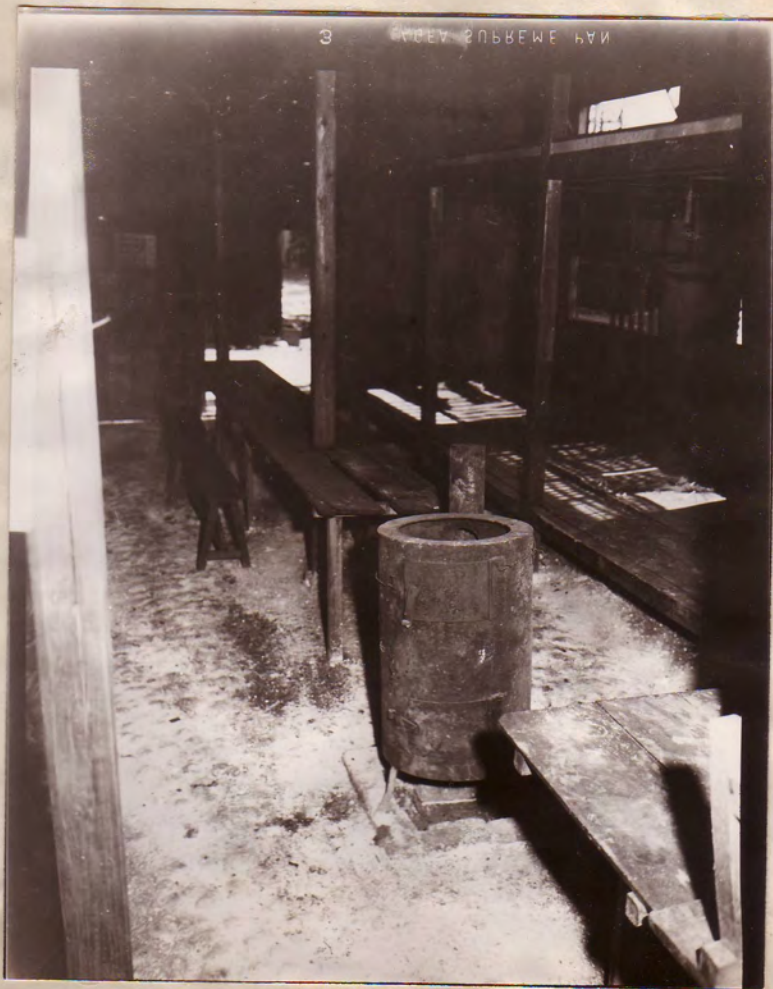
Photograph of the Interior of Barracks and Mess Tables at P.O.W. Nagoya Sub-Camp #2, Narumi.