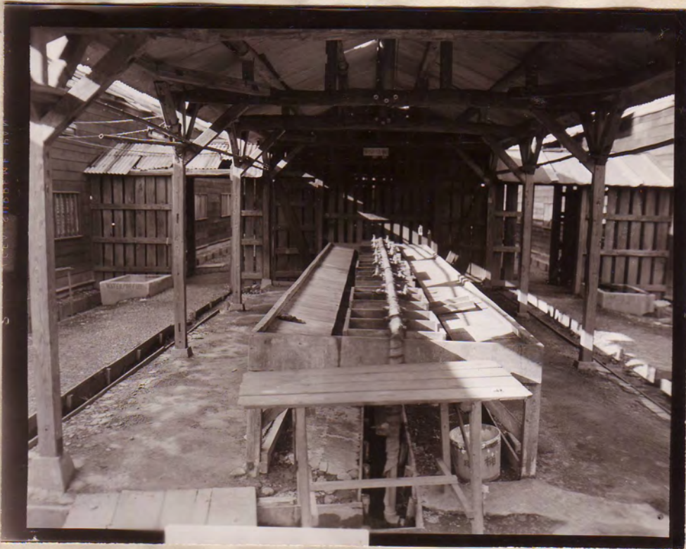
Photograph of the Wash Stand at P.O.W. Nagoya Sub-Camp #2, Narumi.