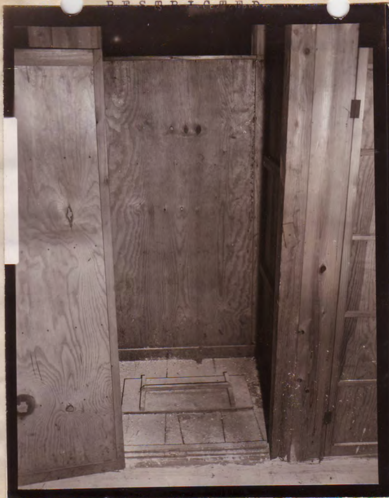
Photograph of the Latrine for General Use at P.O.W. Nagoya Sub-Camp #2, Narumi.