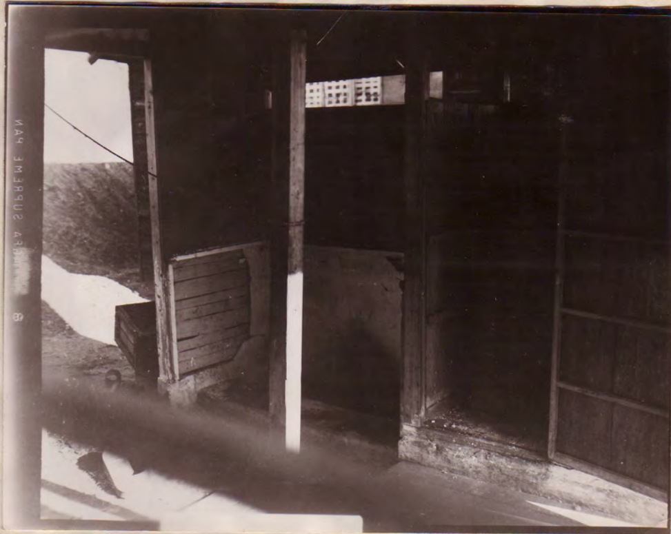
Photograph of the Hospital Latrine at P.O.W. Nagoya Sub-Camp #2, Narumi.