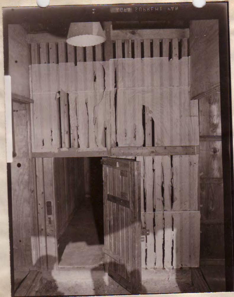
Photograph of the Solitary Confinement Room at P.C.W. Nagoya Sub-Camp #2, Narumi.