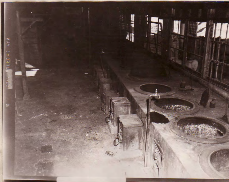
Photograph of the Kitchen at P.O.W. Nagoya Sub-Camp #2, Narumi.