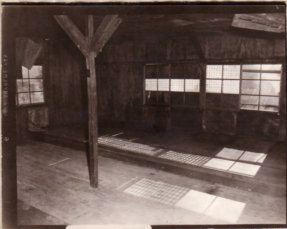
Photograph of the Hospital Ward and Dispensary at P.O.W. Nagoya Sub-Camp#2, Narumi.