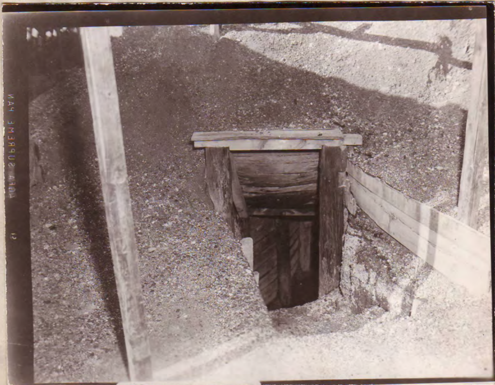
Photograph of the Air-Raid Shelter outside barracks at P.O.W. Nagoya Sub-Camp #2, Narumi.