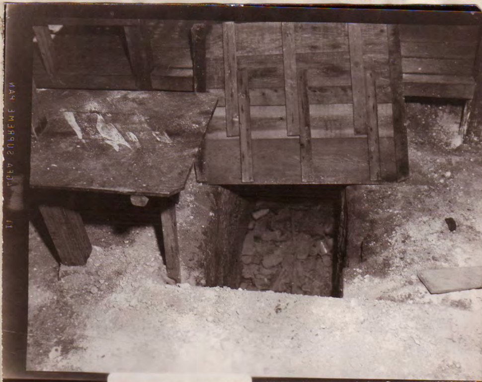
Photograph of the Air-Raid Shelter inside barracks at P.O.W. Nagoya Sub-Camp #2, Narumi.