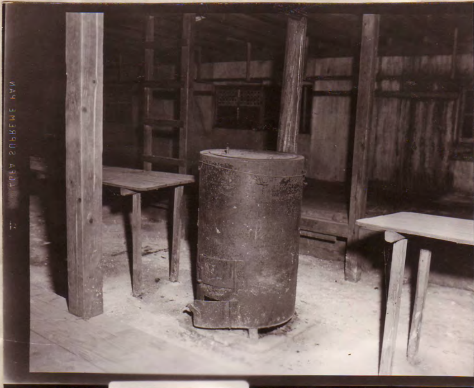
Photograph of the Barracks Heating System at P.O.W. Nagoya Sub-Camp #2, Narumi.