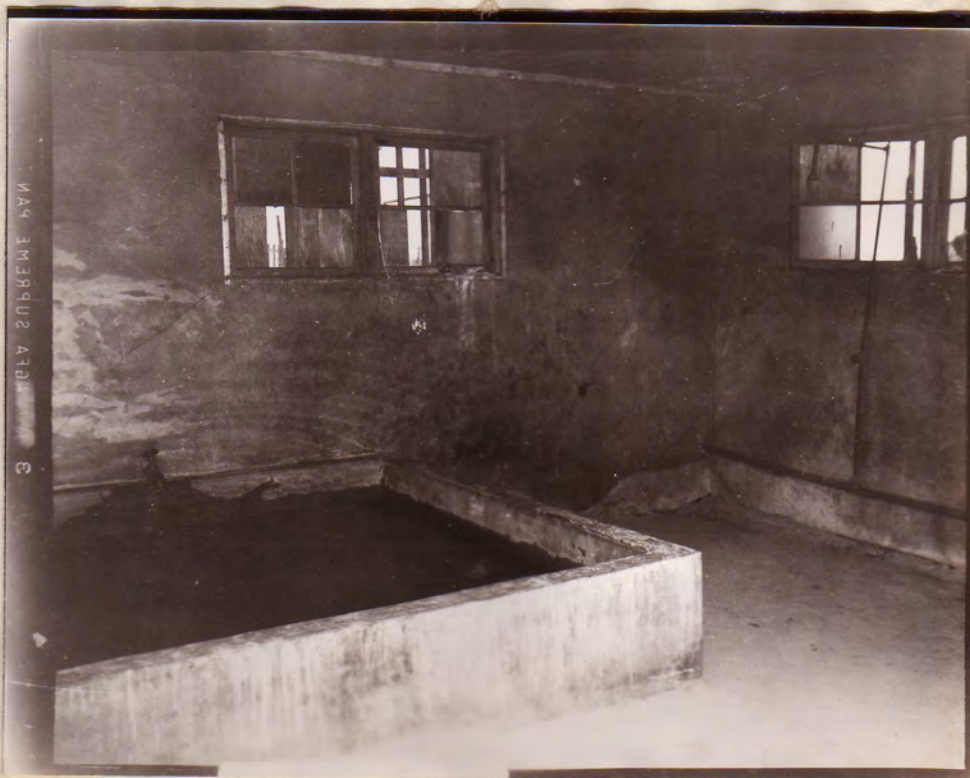
Photograph of the Bath Room at P.O.W. Nagoya Sub-Camp #2, Narumi.