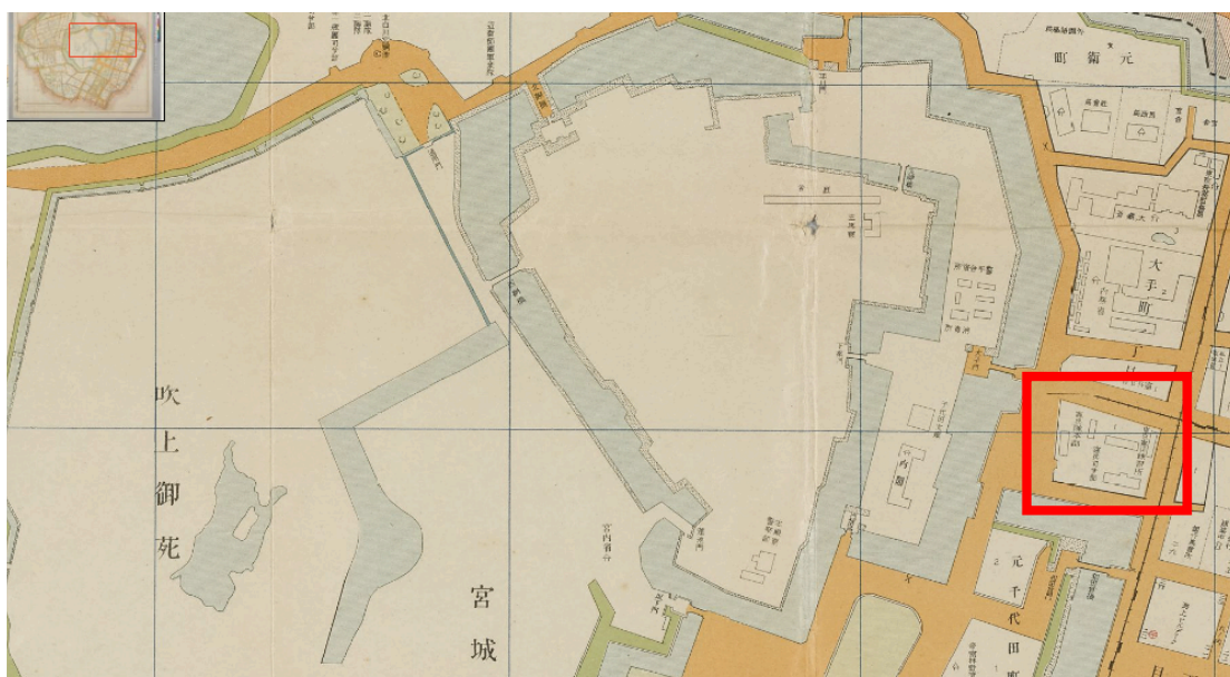
Picture 1: The Kempeitai HQ, shown in the red box, in the 1910s. The Imperial Palace is on its left. See: https://www.research.tokyo-23city.or.jp/home53files/b15_01/banchi_tokyo15_01_kmview-zoom.htm . https://www.research.tokyo-23city.or.jp/2_tokyo_15_top.html .

See: http://en.palacehoteltokyo.com/hotel-overview/history/ . https://en.wikipedia.org/wiki/Palace_Hotel,_Tokyo#cite_note-4 . http://blog.goo.ne.jp/abe-blog/e/1fea0ffd53067afe53237df2846d8f3c .