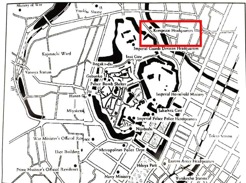
Picture 4: The Kempeitai HQ mentioned above should be the Eastern District Kempeitai Headquarters.