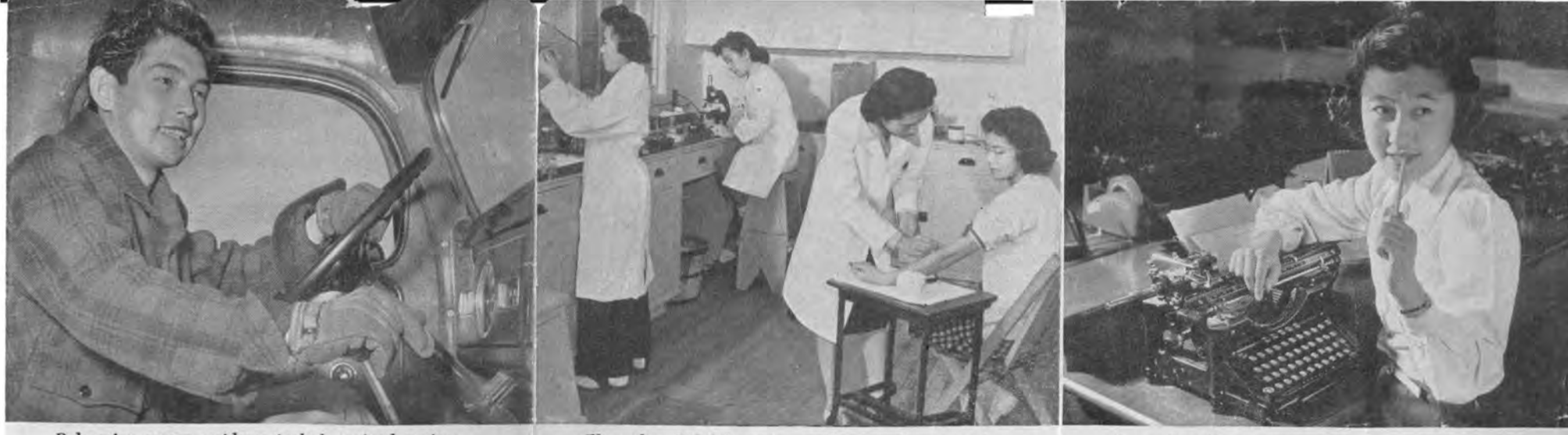
Relocation center residents include trained engineers, mechanics, drivers, shop and mill workers with a variety of skills.

In 10 wartime communities in the western part of the United States, more than a hundred thousand men, women, and children are living temporarily, awaiting an opportunity to resume normal lives in ordinary communities. All of them are of Japanese descent, and were evacuated from strategic military areas of the West Coast in the spring and summer of 1942. These wartime communities, known as relocation centers, were established when it became evident that such a large number of people could not immediately locate themselves successfully in new communities. There was no intent to remove from them any of their rights or to deprive them of the opportunity of earning a livelihood and contributing to the Nation's economy.